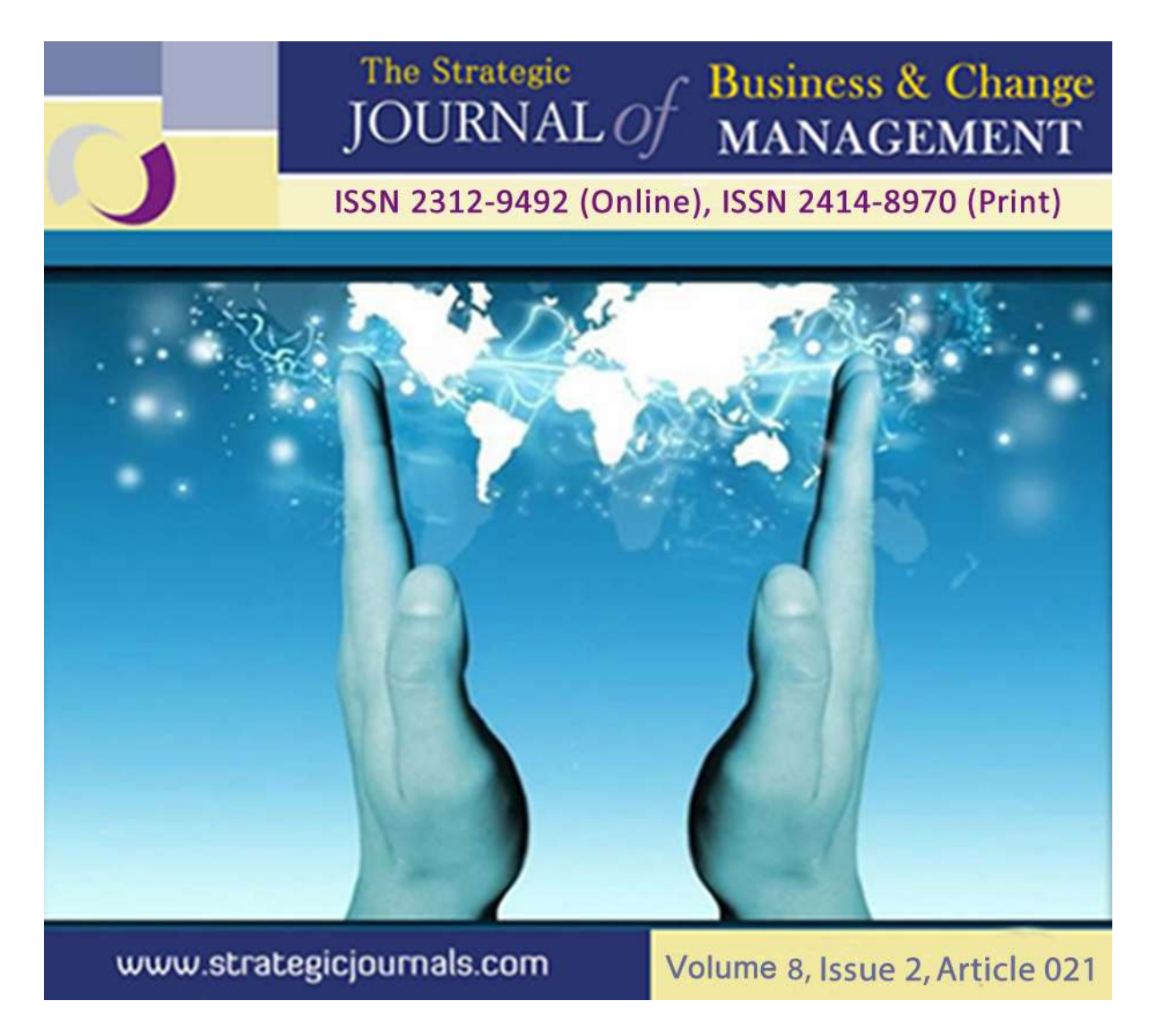
MONITORING & EVALUATION AND PERFORMANCE OF DONOR FUNDED PROJECTS IN RWANDA. A CASE OF USAID/TWIYUBAKE PROJECT