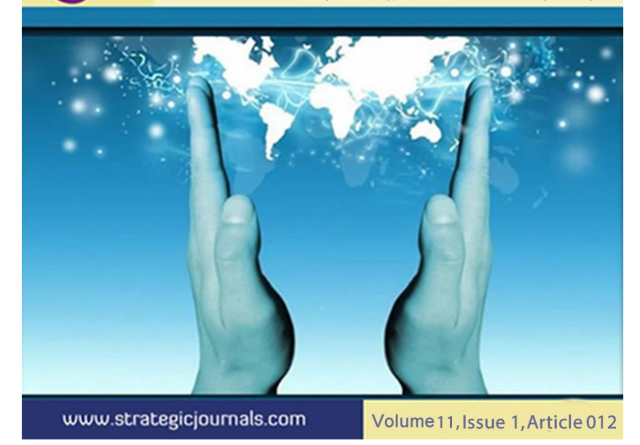
DIFFERENTIATION STRATEGY EFFECTS ON PERFORMANCE OF MILK PROCESSING FIRMS IN KIAMBU COUNTY, KENYA

ISSN 2312-9492 (Online), ISSN 2414-8970 (Print)