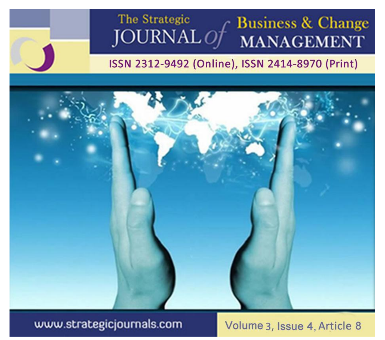
DETERMINANTS OF E-PROCUREMENT IMPLEMENTATION IN KENYAN STATE CORPORATIONS WITHIN THE MINISTRY OF FINANCE