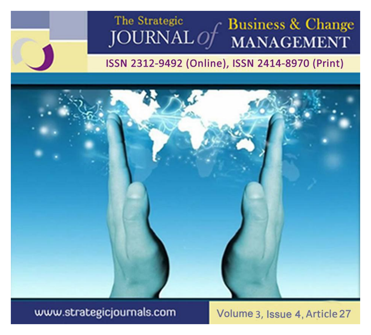
EFFECT OF STRATEGIC CHANGE MANAGEMENT ON ORGANIZATIONAL PERFORMANCE IN PUBLIC UNIVERSITIES IN KENYA