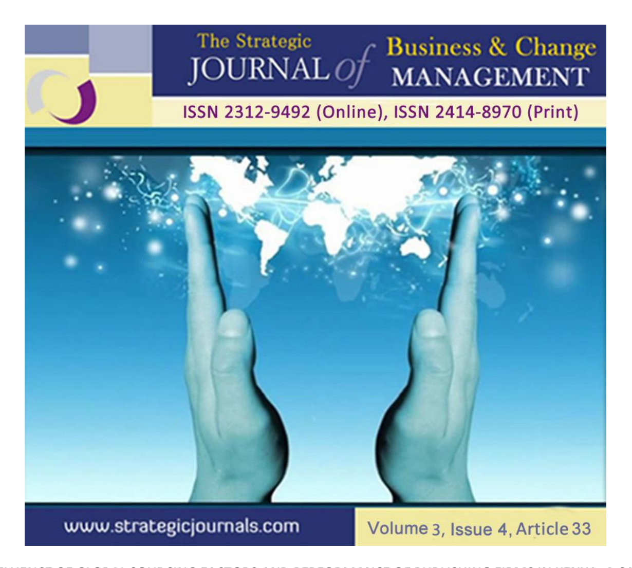
INFLUENCE OF GLOBAL SOURCING FACTORS AND PERFORMANCE OF PUBLISHING FIRMS IN KENYA: A CASE OF LONGHORN PUBLISHERS LIMITED