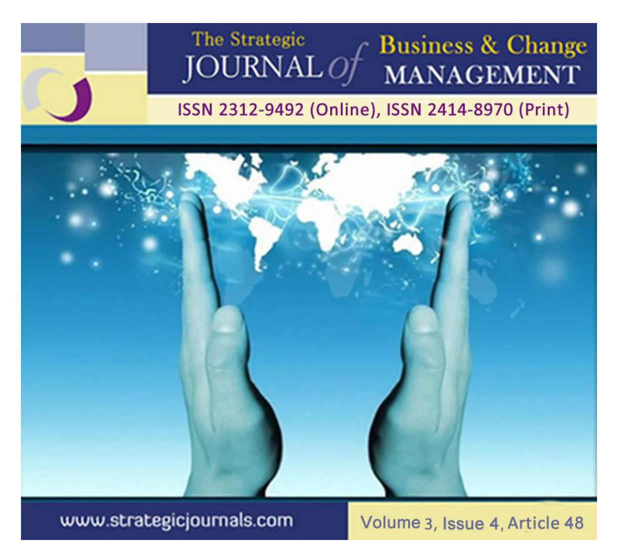
EFFECT OF ORGANIZATIONAL FACTORS ON RETENTION OF GENERATION Y EMPLOYEES IN PARASTATALS: A CASE OF KENYA REVENUE AUTHORITY