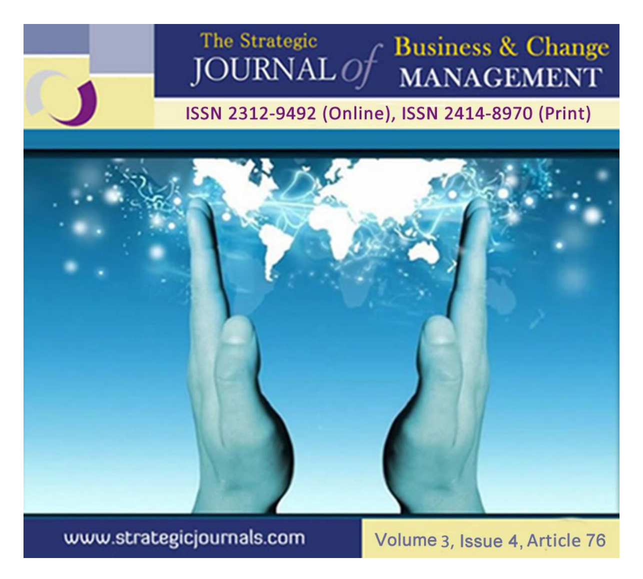
EFFECT OF CORPORATE SOCIAL RESPONSIBILITY ON CORPORATE IDENTITY OF SMALL AND MEDIUM TELECOMMUNICATION FIRMS IN KENYA