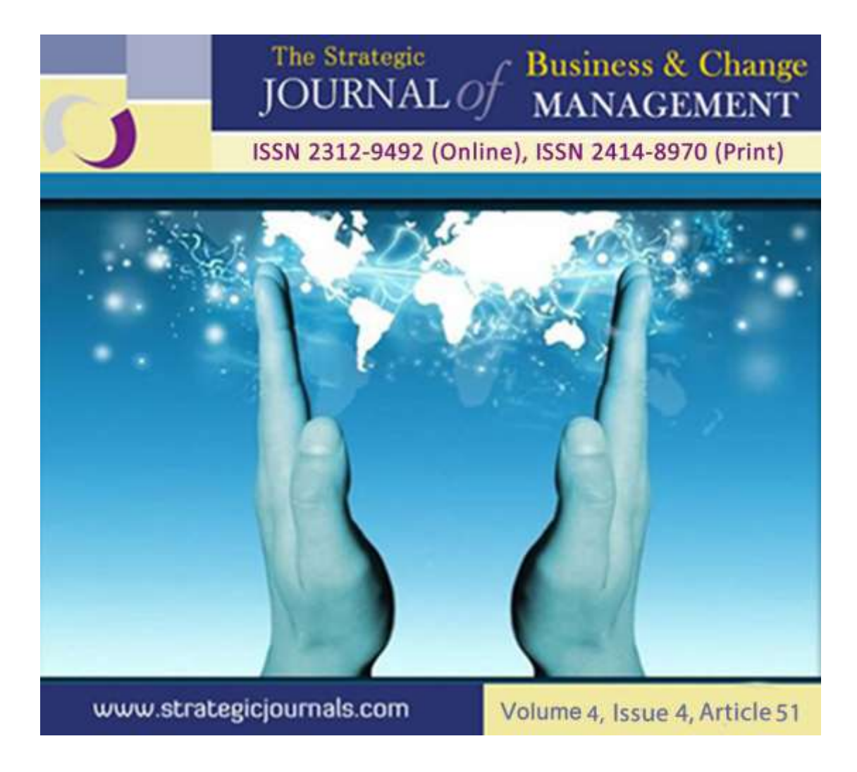
INFORMATION NEEDS AND INFORMATION SEEKING BEHAVIOUR OF MEDIA PROFESSIONALS IN KENYA: A CASE OF NATION MEDIA GROUP