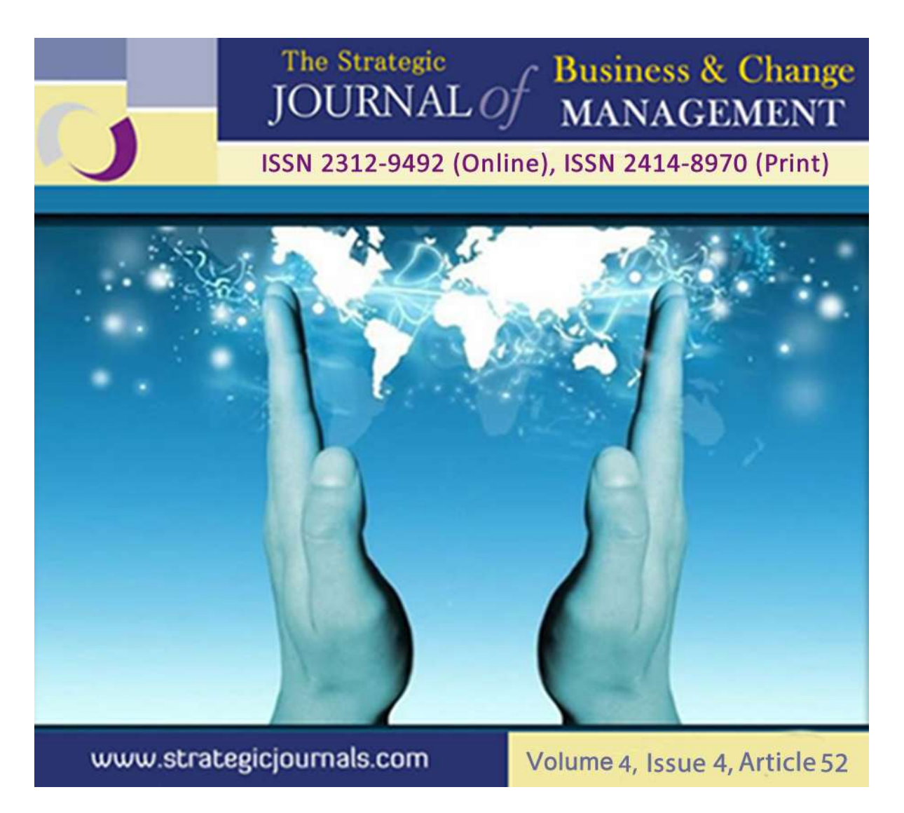
THE INFLUENCE OF ORGANIZATIONAL CULTURE ON EMPLOYEE PERFORMANCE IN KENYA'S CIVIL SERVICE: A CASE OF THE MINISTRY OF WATER AND IRRIGATION