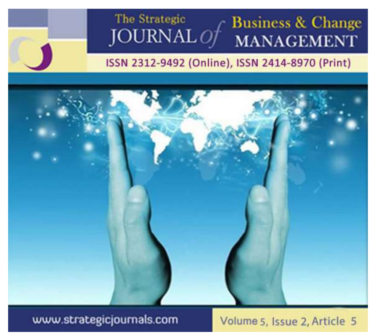
FACTORS INFLUENCING HUMANITARIAN AID DELIVERY IN MOGADISHU, SOMALIA CASE STUDY SACID NON-GOVERNMENTAL ORGANIZATION