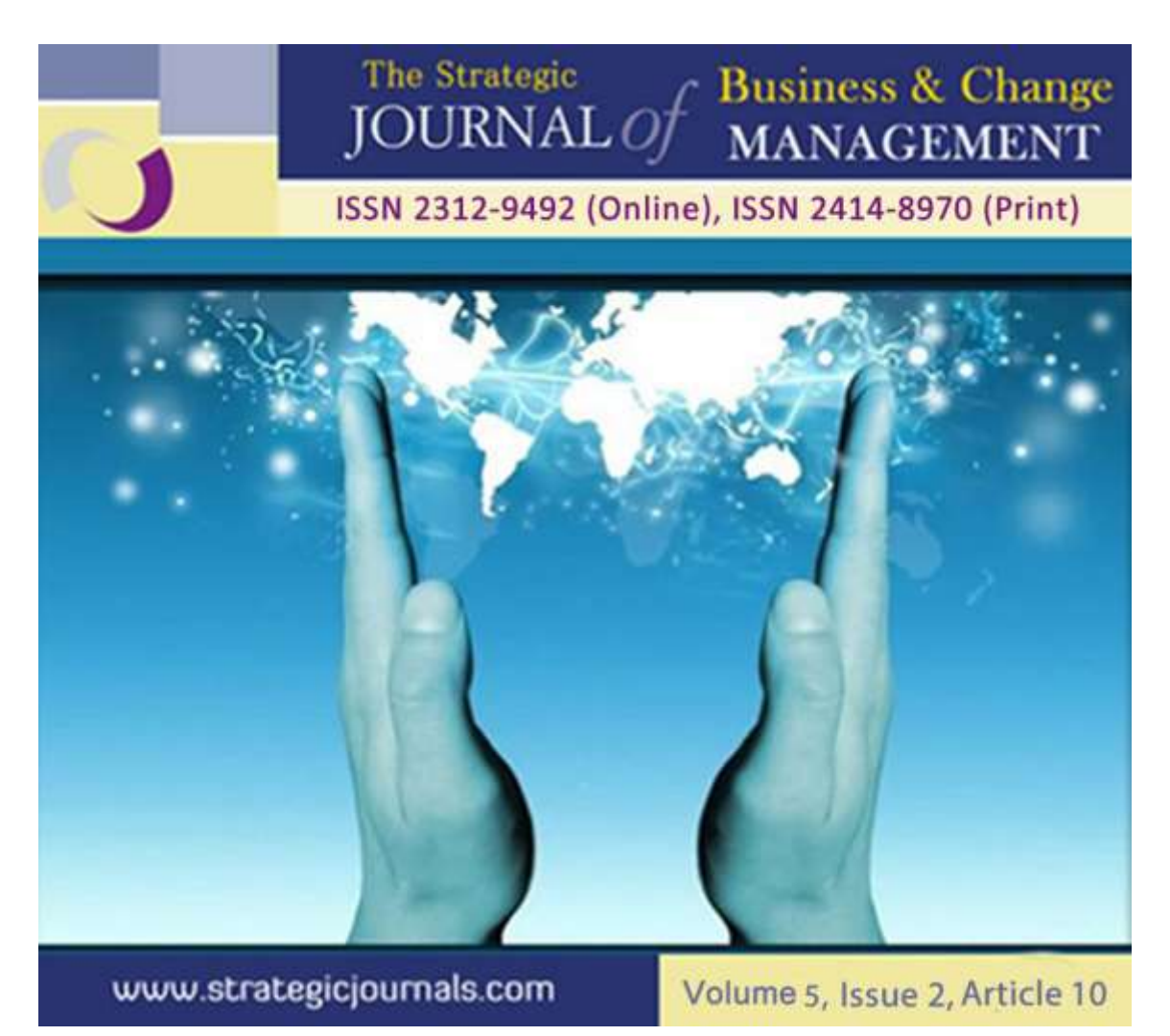
STRATEGIC MANAGEMENT PRACTICES INFLUENCING OPERATIONAL PERFORMANCE OF CONTAINER TERMINALS AT KENYA PORTS AUTHORITY