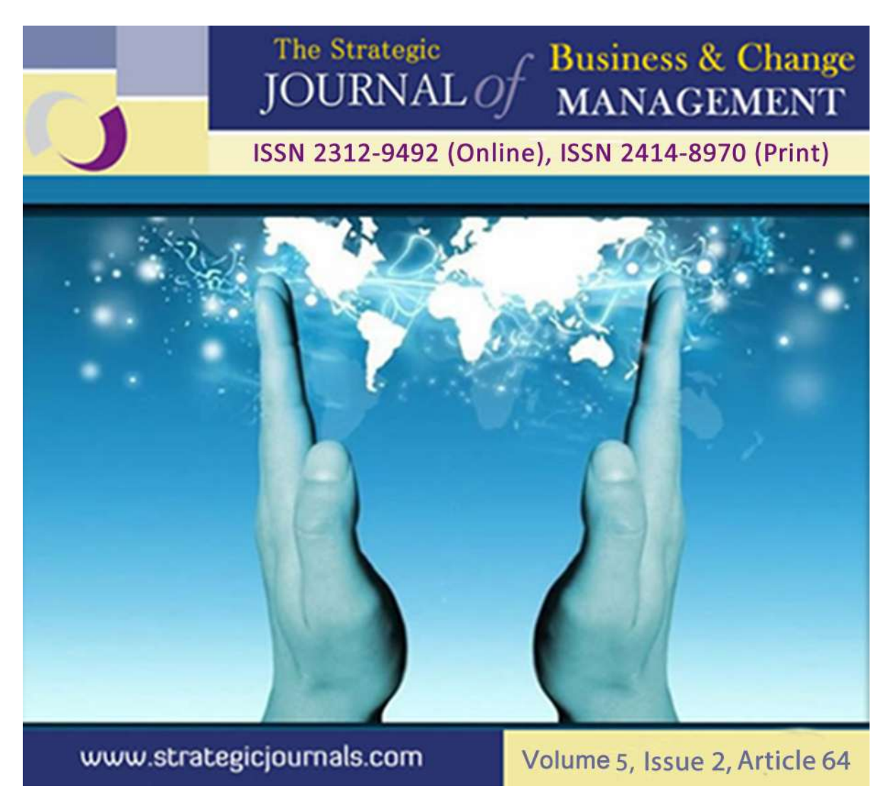
DETERMINANTS OF COMPLETION OF HOUSING PROJECTS IN INFORMAL SETTLEMENTS IN NAIROBI CITY COUNTY, KENYA