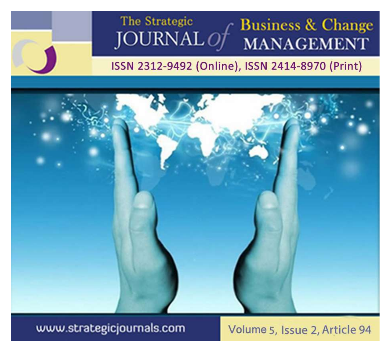
INFLUNCE OF ELECTRONIC BUSINESS PRACTICES ON THE PERFORMANCE OF SUPERMARKETS IN NAIROBI COUNTY, KENYA