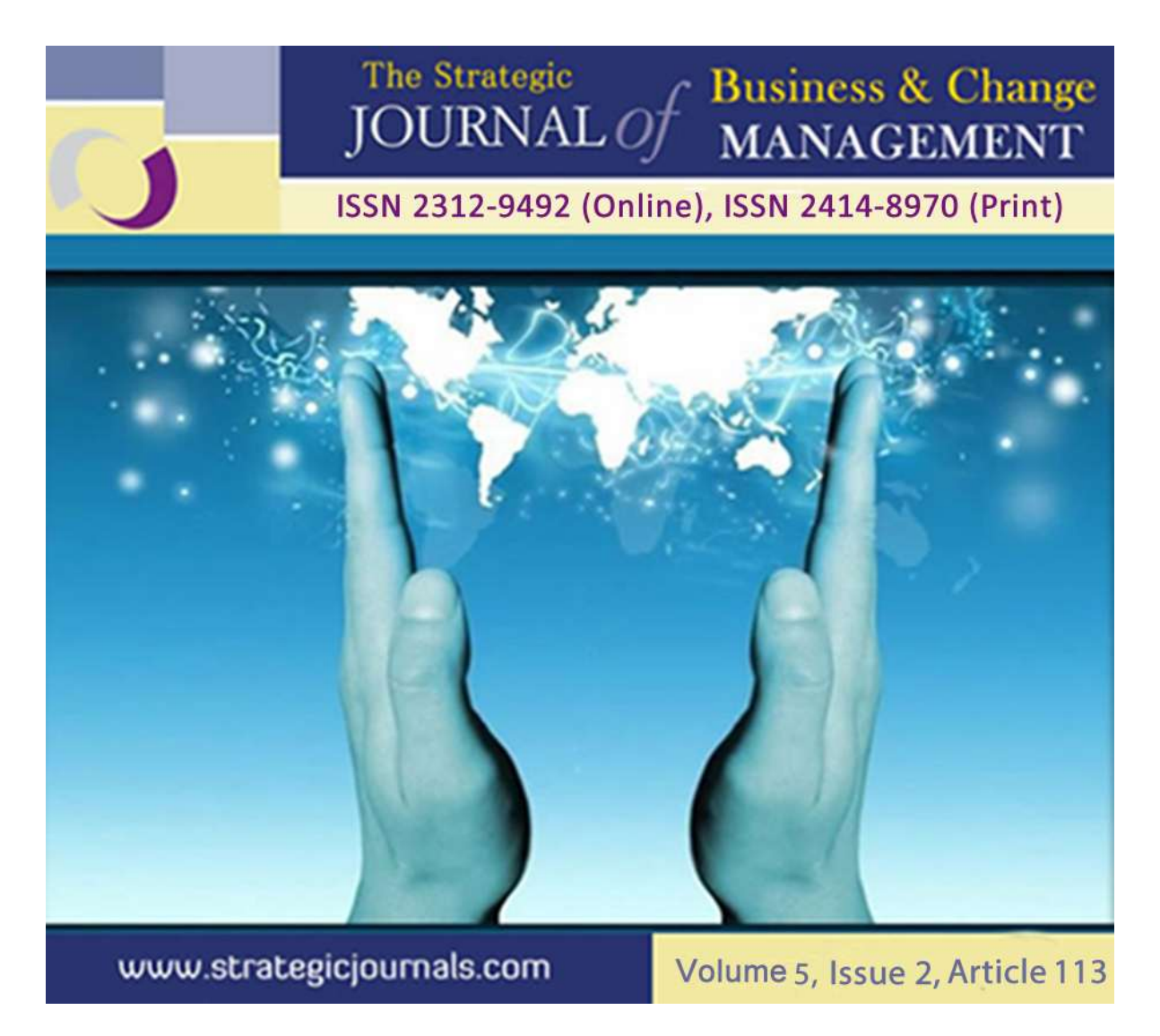
PROJECT MANAGEMENT PRACTICES AND IMPLEMENTATION OF HEALTH PROJECTS IN PUBLIC HOSPITALS IN NYERI COUNTY, KENYA