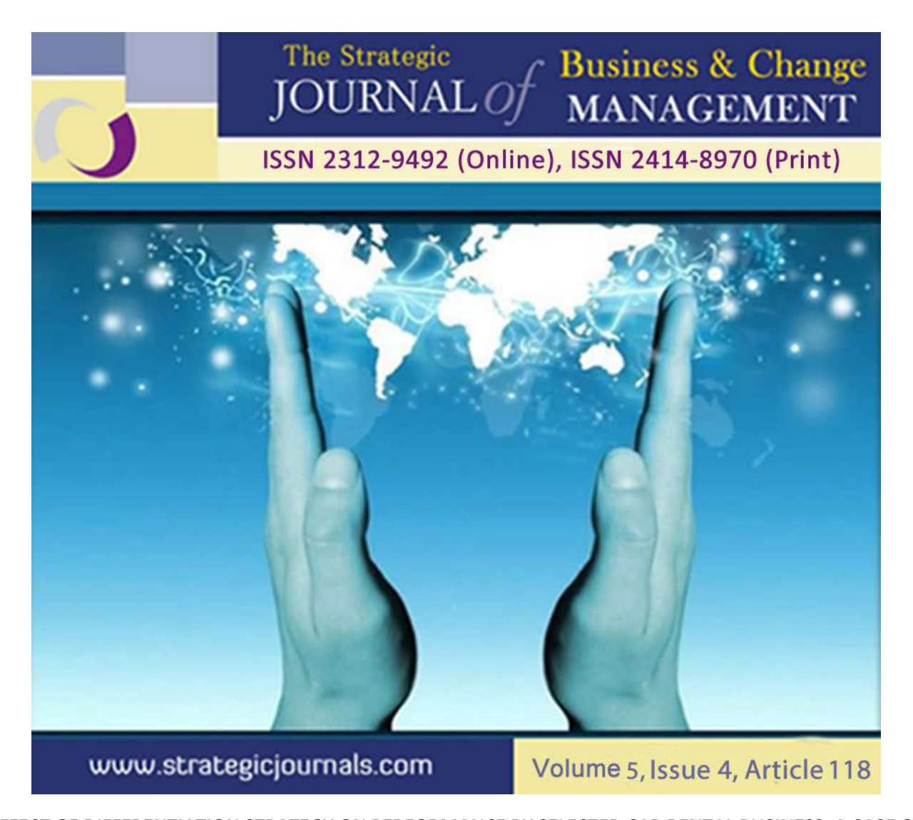
EFFECT OF DIFFERENTIATION STRATEGY ON PERFORMANCE BY SELECTED CAR RENTAL BUSINESS, A CASE OF NAIROBI CITY COUNTY, KENYA